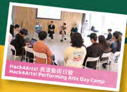
Hack4Arts! 表演藝術日營 Hack4Arts! Performing Arts Day Camp

The Sir Edward Youde Memorial Fund Council currently operates the following award schemes: