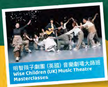
明智孩子劇團 (英國) 音樂劇場大師班 Wise Children (UK) Music Theatre Masterclasses